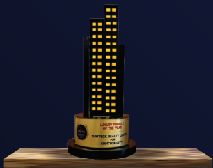
***** LUXURY PROJECT OF THE YEAR 2025 SunteckCity