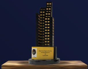
***** MIXED-USE PROJECT OF THE YEAR 2022 SunteckCity