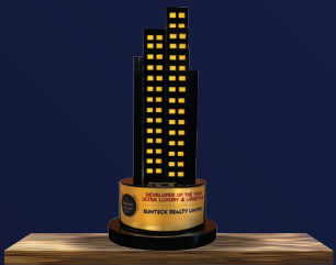
***** Developer of the Year ULTRA LUXURY & LIFESTYLE Sunteck