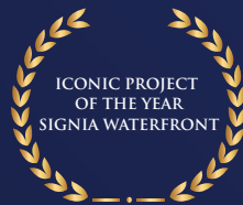
ICONIC PROJECT OF THE YEAR SIGNIA WATERFRONT ZEE BUSINESS - NATIONAL REAL ESTATE LEADERSHIP CONGRESS AND AWARDS - 2019