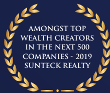
AMONGST TOP WEALTH CREATORS IN THE NEXT 500 COMPANIES - 2019 SUNTECK REALTY